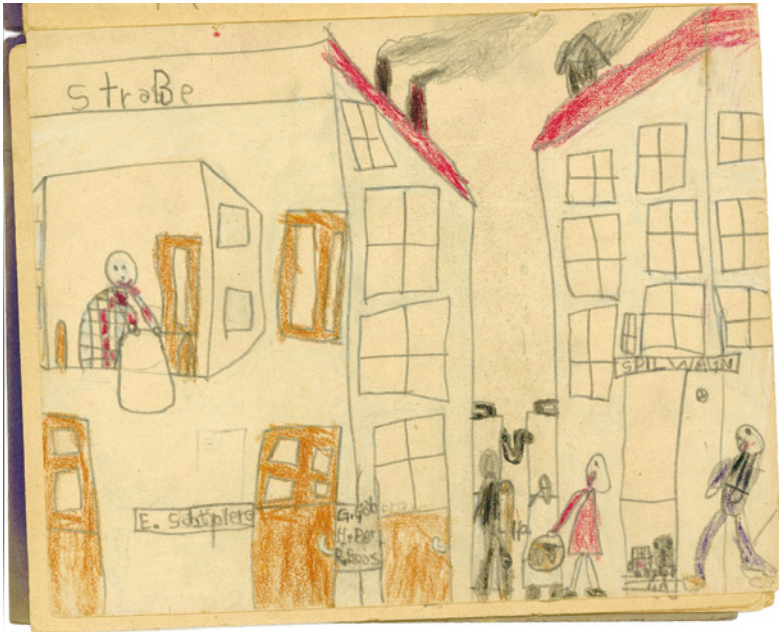
Figure 4: Archive of the Israelitische Töchterschule , 08:H22 (8)

On another page (Figure 4), Popper draws a street scene. We see the fronts of multi-story houses. Doorsigns indicate that several families live here. Another sign points to the entrance of the toy shop, whose display can be seen through the open door. In another open window, a person is airing textiles. People are walking on the street, perhaps they are in a rush to catch the train waiting between the houses. Here, Popper draws a condensed panorama of urban life which we also know from the study Der Lebensraum des Großstadtkindes (The Life Space of the Urban Child) by Martha Muchow. 57 Muchow's pioneering work from the 1930s describes the everyday life of working-class children in the Barmbek district of Hamburg. 58 She gives a dense picture of how children moved in urban