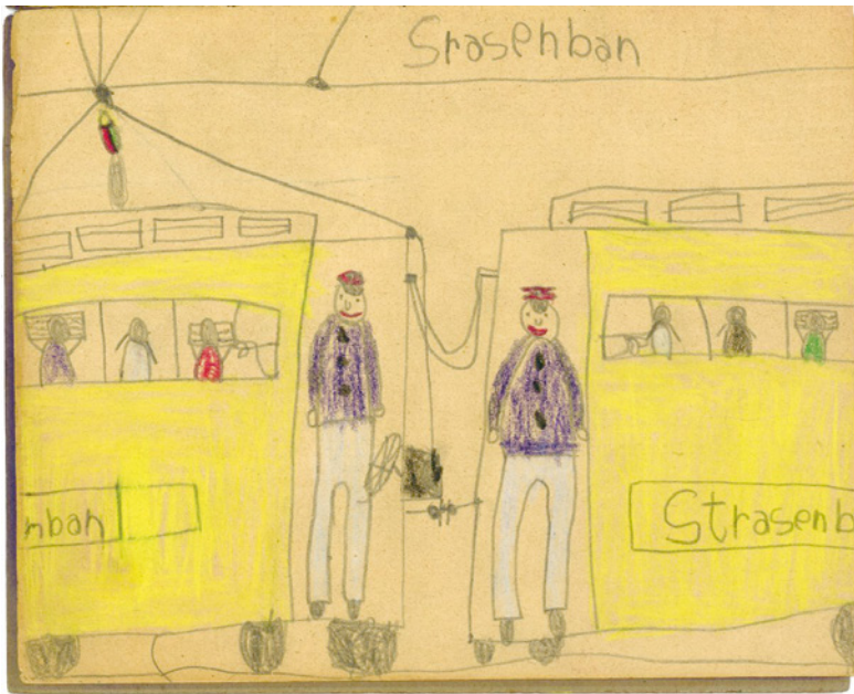
Figure 3: Archive of the Israelitische Töcherschule , 08:H22 (3)

Inside the tram, people are seated, probably on their way to work, reading newspapers. The tram also appears in other drawings and written sources by children from the collection of the Israelitische Töcherschule . Esther Wigderowitsch, a student at the girls' school in 1930, writes about her experience of the dense "crowds" on the tram and the busy conductors. 51 She was particularly impressed by the advertisements on it, an expression of the expanding consumer culture. Metropolitan traffic and the urban infrastructure evidently held a high attraction for Popper; there are further drawings in his drawing book of various vehicles, boats, and street maps. A comparative analysis with other boys' and girls' drawings from the collection could give indications of general or more gender-specific motifs. Referring to school documents, it could be questioned whether these motifs were inspired by a specific curriculum covering the subject of technology in both the girls' and boys' schools.