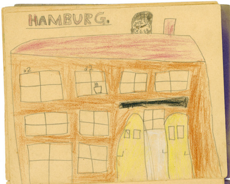
Figure 1 and 2: